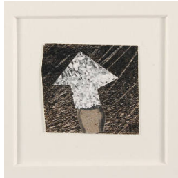
Title: Untitled (Arrow) Date: 1993 Primary Maker: Laurie Tümer Medium: gelatin silver print with oil paint