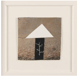
Title: Untitled (House) Date: 1993 Primary Maker: Laurie Tümer Medium: gelatin silver print with oil paint