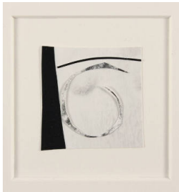
Title: Untitled (Spiral) Date: 1993 Primary Maker: Laurie Tümer Medium: gelatin silver print with oil paint