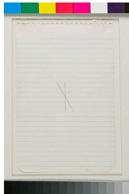
Title: Rome Drawing #71 Date: 1974 Primary Maker: Richard Tuttle Medium: graphite on lined notebook paper