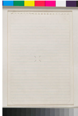
Title: Rome Drawing #44 Date: 1974 Primary Maker: Richard Tuttle Medium: graphite on lined notebook paper