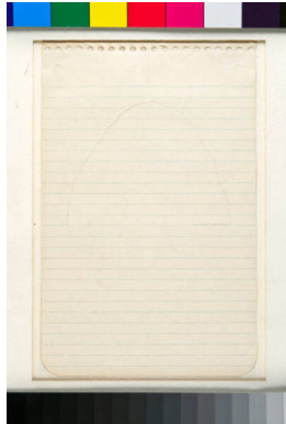
Title: Rome Drawing #15 Date: 1974 Primary Maker: Richard Tuttle Medium: graphite on lined notebook paper