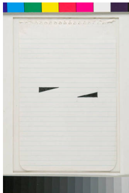
Title: Rome Drawing #63 Date: 1974 Primary Maker: Richard Tuttle Medium: black felt tip pen on lined notebook paper