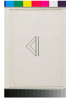
Title: Rome Drawing #7 Date: 1974 Primary Maker: Richard Tuttle Medium: black felt tip pen and graphite on notebook paper