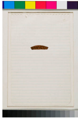
Title: Rome Drawing #6 Date: 1974 Primary Maker: Richard Tuttle Medium: brown felt tip pen and graphite on notebook paper