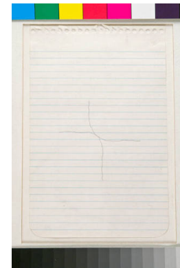
Title: Rome Drawing #78 Date: 1974 Primary Maker: Richard Tuttle Medium: graphite on lined notebook paper