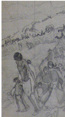
Title: The Long Walk of the Navajos

Medium: gouache, ink and pencil on board