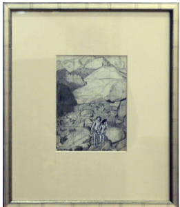
Title: Adam and Eve in a Mountain Landscape