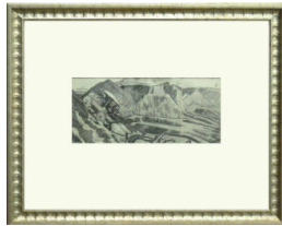
Title: Horse Drawn Wagon in Picuris

Medium: ink, watercolor, Chinese white on paper mounted on paper