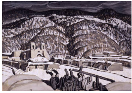
Title: Penitente Procession