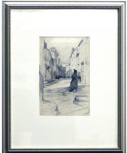
Title: Paris Date: circa 1895 Primary Maker: Ernest L. Blumenschein Medium: ink and pencil on paper