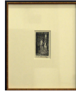
Title: Untitled (Adam and Eve in Forest) Date: n.d. Primary Maker: Ernest L. Blumenschein Medium: ink and pencil on paper mounted on board