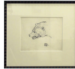
Title: Head of a Bear

Medium: pencil on paper mounted on cardboard