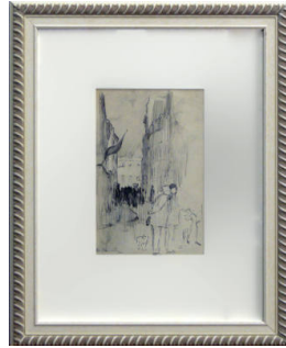
Title: Rue Blainville, Paris Date: circa 1895 Primary Maker: Ernest L. Blumenschein Medium: ink and pencil on paper