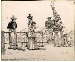
Title: On the Museum Steps Date: 1893 Primary Maker: Ernest L. Blumenschein Medium: Ink on wove paper