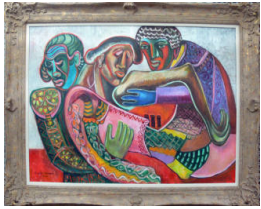
Title: Death of a Bullfighter Date: 1980 Medium: oil on canvas