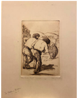
Title: "The Bull Fight" Santo Domingo Date: 1927 Primary Maker: Will Shuster Medium: etching on wove paper