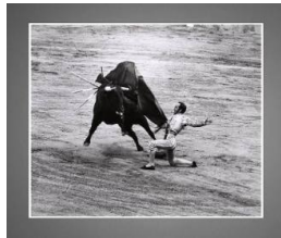
Title: Corrida Date: n.d. Primary Maker: Max Alpert Medium: gelatin silver print