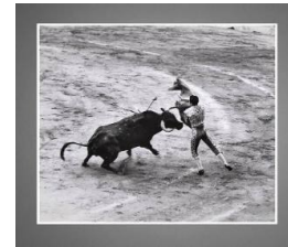
Title: Corrida Date: n.d. Primary Maker: Max Alpert Medium: gelatin silver print