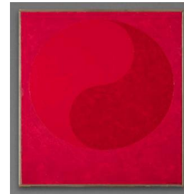
Title: Yang-Ying II Date: 1964 Primary Maker: Oli Sihvonen Medium: oil on Masonite