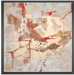
Title: Desert Heart Lines Date: 2000 Medium: acrylic and sand on canvas