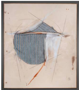
Title: Untitled Date: 1977 Primary Maker: Allan Graham Medium: watercolor, oil and stick pigment on canvas