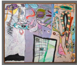
Title: Untitled Date: 1971 Primary Maker: Sam Scott Medium: Oil on canvas