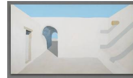
Title: Courtyard Date: 1978 Primary Maker: Ron Robles Medium: Acrylic on canvas