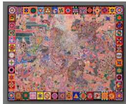
Title: The Cloudwalker Date: 1972 Primary Maker: Charles Greeley Medium: acrylic on canvas