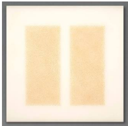
Title: White Field #16 Date: 1999 Primary Maker: Phil Binaco Medium: encaustic, wax on board with mica