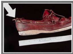
Title: Exhibit B: Moccasin Attacked (from the series Crime in the Home)

Primary Maker: Betty Hahn Medium: silver-dye bleach print