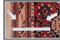
Title: Exhibit A: Oriental Rug Chewed (from the series Crime in the Home)

Primary Maker: Betty Hahn Medium: silver-dye bleach print