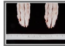
Title: Exhibit J: Suspect in Fingerprint Lab (from the series Crime in the Home)

Primary Maker: Betty Hahn Medium: silver-dye bleach print