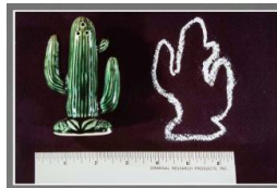
Title: Exhibit F: Salt Shaker, Destroyed (from the series Crime in the Home)