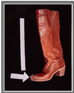
Title: Exhibit G: Cowboy Boot, Assaulted (from the series Crime in the Home)