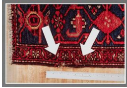
Title: Exhibit C: Second Oriental Rug Chewed (from the series Crime in the Home)