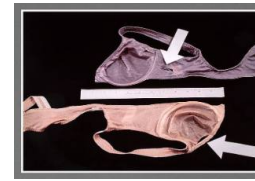
Title: Exhibit E: Underwear, Molested (from the series Crime in the Home)

Primary Maker: Betty Hahn Medium: silver-dye bleach print