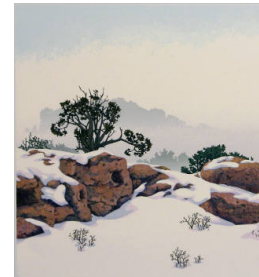
Title: Twelve Months - January (Morning Mist--Tsankawi) Date: 1989 Primary Maker: Kate Krasin Medium: Serigraph