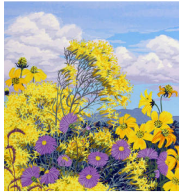
Title: Twelve Months - September (Roadside) Date: 1989 Primary Maker: Kate Krasin Medium: Serigraph