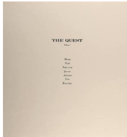
Title: Contents Page (from the portfolio The Quest) Date: n.d. Primary Maker: Kate Krasin Medium: relief print