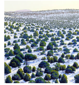
Title: Twelve Months - December (Winter Solstice) Date: 1988 Primary Maker: Kate Krasin Medium: Serigraph