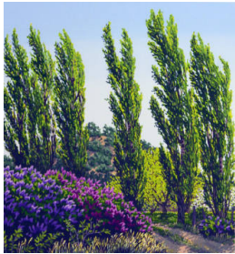
Title: Twelve Months - April (Morning--Tesuque) Date: 1989 Primary Maker: Kate Krasin Medium: Serigraph