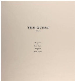
Title: Title Page (from the portfolio The Quest) Date: n.d. Primary Maker: Kate Krasin Medium: relief print