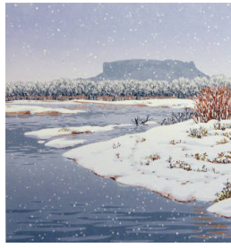
Title: Twelve Months - February (Black Mesa from the Rio Grande) Date: 1990 Primary Maker: Kate Krasin Medium: serigraph