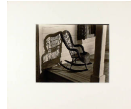
Title: American Rural Baroque Date: 1929 (printed 1980-1981) Primary Maker: Ralph Steiner Medium: gelatin silver print