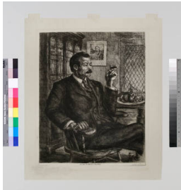
Title: Robert Henri, Painter Date: 1931 Primary Maker: John Sloan Medium: etching