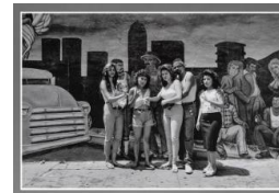
Title: East L.A., White Fence (from the series White Fence, East L.A.) Date: 1986 Primary Maker: Graciela Iturbide Medium: gelatin silver print