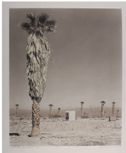
Title: Salton Sea, Small Building Date: 1986 Primary Maker: Joan Myers Medium: Platinum-palladium print with watercolor