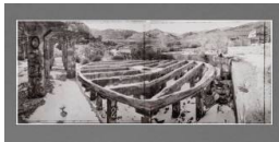
Title: Cyanide tank support ruins at abandoned silver mill, American Flat, Nevada Date: 1981 (printed 2013) Primary Maker: Martin Stupich Medium: pigment print