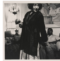
Title: Untitled (Woman in Tunic) Date: circa 1974-75 Primary Maker: Anne Noggle Medium: gelatin silver print