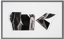
Title: The Bird of the Wild Date: 2015 Primary Maker: Carl Chiarenza Medium: Collage of 4 gelatin silver prints