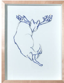
Title: Blue Moose Date: 2002 Primary Maker: Benjamin Chickadel Medium: cut paper with permanent ink and two pins