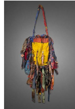
Title: Bag IX Date: 1971 Primary Maker: Harmony Hammond Medium: Paint on cloth