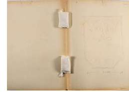
Title: Color Plate 1 Date: 1927-1931 Primary Maker: Diego Rivera Medium: pencil on paper