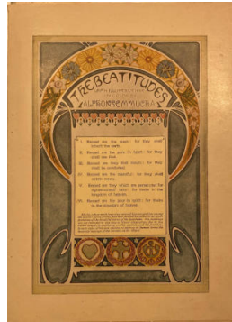
Title: The Beatitudes with Illustrations in Color by Alphonse M. Mucha Date: c. 1906 Primary Maker: Alphonse Maria Mucha Medium: ink on paper