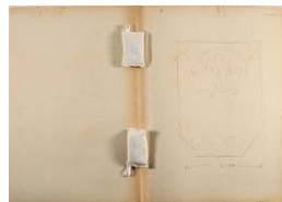
Title: Color Plate 1 Date: 1927-1931 Primary Maker: Diego Rivera Medium: pencil on paper