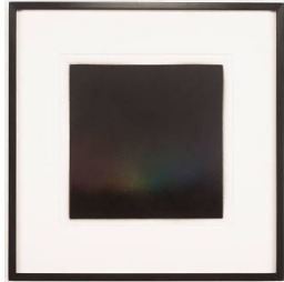
Title: Untitled (soft color) Date: 2009 Primary Maker: Eric Garduño Medium: Enamel on vellum paper