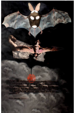
Title: Bats (from the series Extinction) Date: 1992 Primary Maker: Bobbe Besold Medium: Van Dyke print with gouache, watercolor, pastel, and graphite