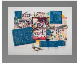
Title: For Ten Points: How do you tell one story line from another when you are inside their transparent overlapping parameters? Date: August, 1984 Primary Maker: Rita DeWitt Medium: Collage, color xerography, and cyanotype with drawing