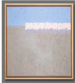
Title: Apple Orchard Date: 1976 Primary Maker: Sibyl Saam, American, born Germany 1928 Medium: Oil on canvas