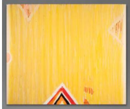
Title: #2 Date: 1991 Primary Maker: Lawrence Calcagno Medium: oil on canvas