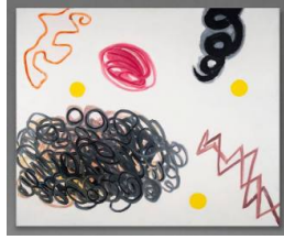
Title: #2 Date: 1990 Primary Maker: Lawrence Calcagno Medium: Oil on canvas