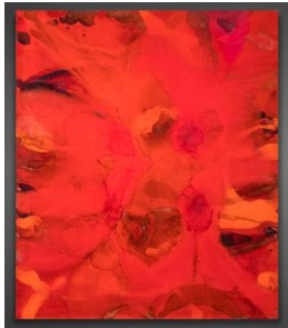
Title: Between Two Oceans Date: 2000 Primary Maker: Dirk De Bruycker Medium: asphalt, oil, gesso and enamel on canvas