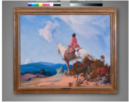
Title: The Passing Storm, Navajo Country Date: before 1934 Primary Maker: Gerald Cassidy Medium: oil on canvas