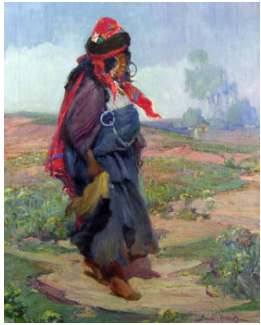
Title: The Bedouin Date: 1927 Primary Maker: Gerald Cassidy Medium: Oil on canvas