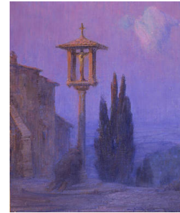
Title: Fiesole, Italy Date: 1926 Primary Maker: Gerald Cassidy Medium: oil on canvas