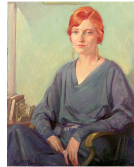
Title: Lady With the Earrings Date: n.d. Primary Maker: Gerald Cassidy Medium: oil on canvas