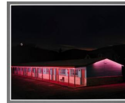
Title: Capri Motel, Raton, New Mexico, 1980 Date: Negative 1980, print 2019 Primary Maker: Steve Fitch Medium: Pigment print