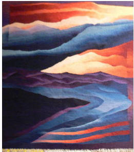
Title: Blue Cloud (from the Ghost Rug series) Date: 1984 Primary Maker: Janusz Kozikowski Medium: wool with cibachrome dyes