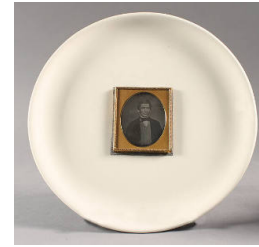
Title: Untitled (plate) Date: 1994 Primary Maker: Thomas Barrow Medium: ceramic, silver-plated copper plate, gilt brass, glass