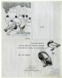
Title: Mallard Drake Date: mid 20th Century Primary Maker: Ernest L. Blumenschein Medium: pencil and ink on paper