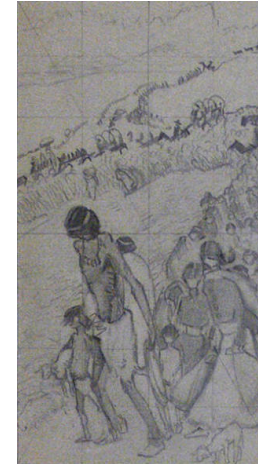
Title: The Long Walk of the Navajos Date: n.d. Primary Maker: Ernest L. Blumenschein Medium: graphite on cardboard