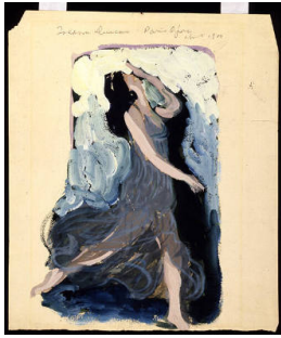
Title: Isadora Duncan - Paris Opera Date: circa 1900 Primary Maker: Ernest L. Blumenschein Medium: gouache on laid paper