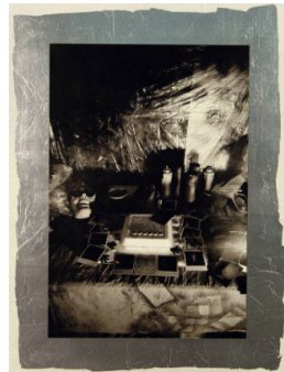
Title: Studio Notes Date: 1992 Primary Maker: Thomas Barrow Medium: Waterless lithograph