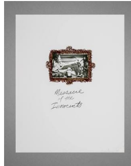
Title: Massacre of the Innocents Date: 1989 Primary Maker: Thomas Barrow Medium: color lithograph