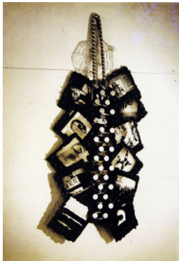
Title: Studio Notes Date: 1992 Primary Maker: Thomas Barrow Medium: Waterless lithograph