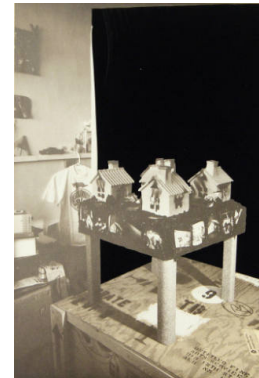
Title: Studio Notes Date: 1992 Primary Maker: Thomas Barrow Medium: Waterless lithograph