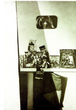
Title: Studio Notes Date: 1992 Primary Maker: Thomas Barrow Medium: Waterless lithograph