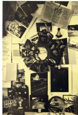
Title: Studio Notes Date: 1992 Primary Maker: Thomas Barrow Medium: Waterless lithograph