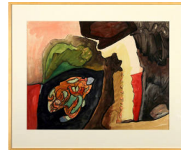
Title: Pleonastic Date: 1971 Primary Maker: William Lumpkins Medium: watercolor on paper