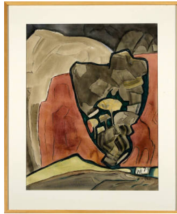
Title: APAQZ Date: 1974 Primary Maker: William Lumpkins Medium: watercolor on paper