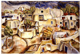
Title: Indian Village Date: 1934 Primary Maker: William Lumpkins Medium: watercolor and pencil on plaster on board