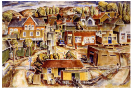
Title: Anglo Village Date: 1934 Primary Maker: William Lumpkins Medium: watercolor and pencil on plaster on board