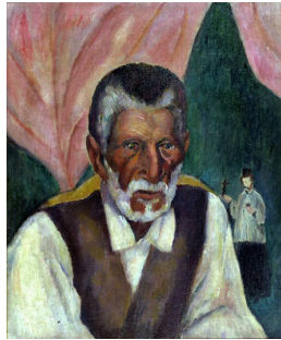
Title: The Sacristan of Trampas Date: 1918 Primary Maker: Paul Burlin Medium: oil on canvas