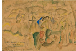
Title: Untitled Date: 1917 Primary Maker: Paul Burlin Medium: pencil and watercolor wash on paper