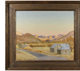
Title: Our Valley in Autumn Date: late 1960s Primary Maker: Peter Hurd Medium: Tempera on board