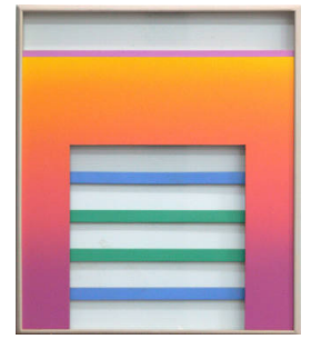
Title: Polymer No. 8 (Two Cut Out Open Spatial Shapes) Date: 1974 Primary Maker: Raymond Jonson Medium: Acrylic on wood