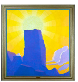
Title: Light Date: 1917 Primary Maker: Raymond Jonson Medium: oil on canvas