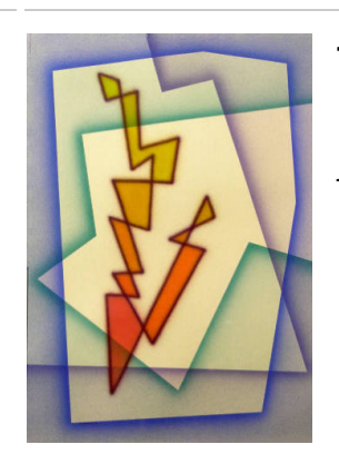
Title: Watercolor #3 Date: 1947 Primary Maker: Raymond Jonson Medium: Watercolor