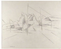
Title: Untitled (Rio Chiquito Barns) Date: 1968 Primary Maker: Andrew Dasburg Medium: ink on paper