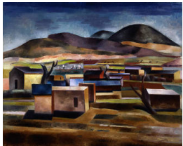
Title: Taos Houses (New Mexican Village) Date: 1926 Primary Maker: Andrew Dasburg Medium: oil on canvas