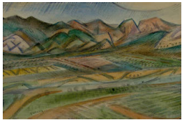
Title: Ranchos Valley Date: n.d. Primary Maker: Andrew Dasburg Medium: Watercolor