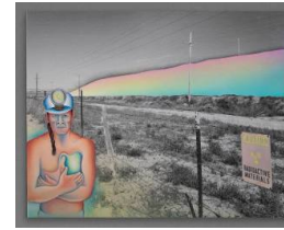
Title: Grants, New Mexico [from the series Nuclear Waste(d)] Date: 1989 Primary Maker: Judy Chicago Medium: sprayed acrylic, oil and photography on photolinen