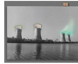
Title: Put a Cork In It [from the series Nuclear Waste(d)] Date: 1989 Primary Maker: Judy Chicago Medium: sprayed acrylic, oil and photography on photolinen with cork