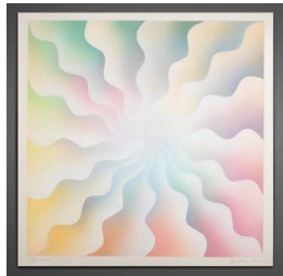
Title: Great Ladies 2 Date: 1972 Primary Maker: Judy Chicago Medium: Airbrush on paper