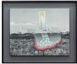
Title: Eureka, or What's a Mother For? [from the series Nuclear Waste(d)] Date: 1989 Primary Maker: Judy Chicago Medium: sprayed acrylic, oil and photography on photolinen