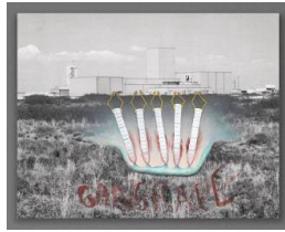
Title: Gang Bang at the WIPP Site [from the series Nuclear Waste (d)] Date: 1989 Primary Maker: Judy Chicago Medium: sprayed acrylic, oil and photography on photolinen