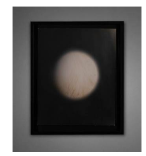
Title: O #13 Date: 2000