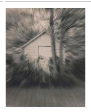
Title: The House Date: 2001