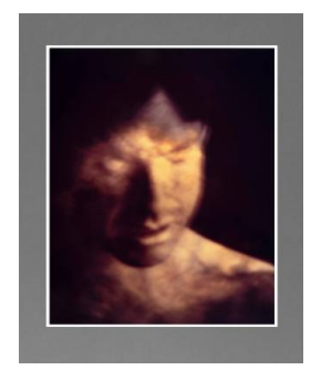
Title: Self-Portrait (Color Series) [unique]