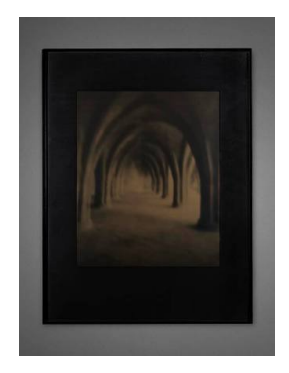
Title: Arches Date: 1999 Primary Maker: P