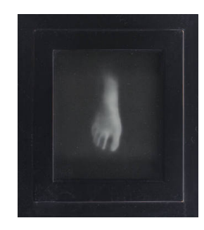
Title: Foot (from the series 5) Date: 1995