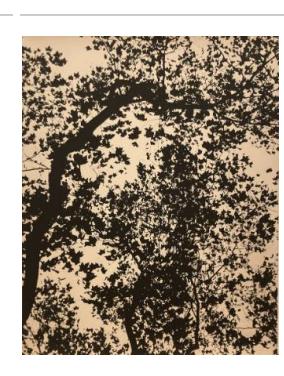
Title: Leaves, London