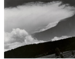
Title: Clouds Date: n.d. Primary Maker: Edward Weston Medium: gelatin silver print