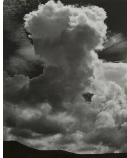
Title: Cloud Date: 1933 (printed 1937) Primary Maker: Edward Weston Medium: gelatin silver print