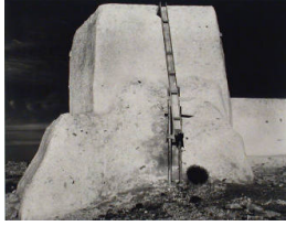
Title: Church at Laguna Pueblo Date: 1933 (printed 1937) Primary Maker: Edward Weston Medium: gelatin silver print