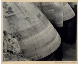
Title: Coolidge Dam, Arizona Date: 1937 Primary Maker: Edward Weston Medium: gelatin silver print