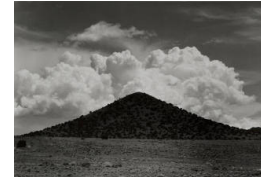
Title: Hill and Clouds Date: 1933 (printed 1937) Primary Maker: Edward Weston Medium: gelatin silver print