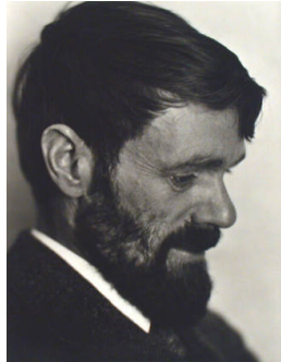
Title: D. H. Lawrence, Mexico Date: 1924 Primary Maker: Edward Weston Medium: gelatin silver print