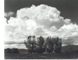
Title: At Taos Primary Maker: Edward Weston Medium: gelatin silver print