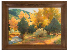
Title: Taos Cañon: Cottonwood, Box Elder, Cedar, and Sage Date: circa 1935 Primary Maker: Joseph Henry Sharp Medium: oil on canvas