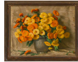
Title: Marigold-Calendula Date: circa 1935 Primary Maker: Joseph Henry Sharp Medium: oil on canvas