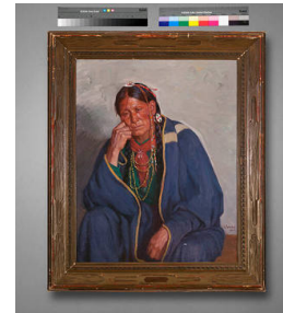
Title: Taos Indian Portrait Date: 1914 Primary Maker: Joseph Henry Sharp Medium: oil on canvas