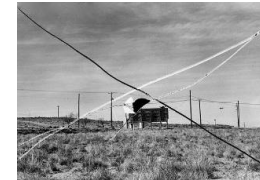
Title: Flight Field (From Cancellations Series)