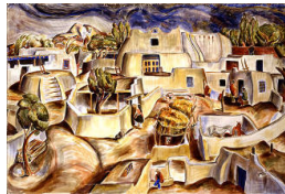
Title: Indian Village Date: 1934 Primary Maker: William Lumpkins Medium: watercolor and pencil on plaster on board