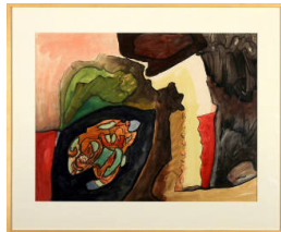
Title: Pleonastic Date: 1971 Primary Maker: William Lumpkins Medium: watercolor on paper