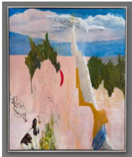
Title: Elevation and Entanglement in Ribera Date: 2009 Primary Maker: Eugene Newmann Medium: oil on canvas