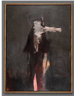
Title: Black Figure Date: 1977 Primary Maker: Eugene Newmann Medium: oil on canvas