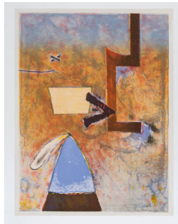
Title: Figures With A Purple V Date: 1976 Primary Maker: Eugene Newmann Medium: Lithograph