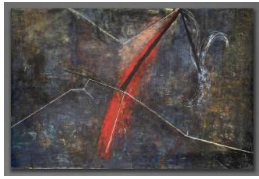
Title: The 22nd Hour (from The Raft Project series) Date: 1991 Primary Maker: Eugene Newmann Medium: oil on canvas over acrylic base with oil stick