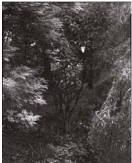
Title: The Garden, Orgeval (from Portfolio Two: The Garden) Date: 1964 (printed 1975) Primary Maker: Paul Strand Medium: gold-toned and varnished gelatin silver print