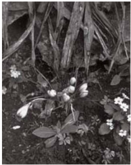
Title: Crocuses and Primroses, Orgeval (from Portfolio Two: The Garden) Date: 1957 (printed 1975) Primary Maker: Paul Strand Medium: gold-toned and varnished gelatin silver print