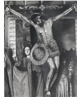
Title: Cristo, Oaxaca (from The Mexican Portfolio) Date: 1932, printed 1967 Primary Maker: Paul Strand Medium: photogravure