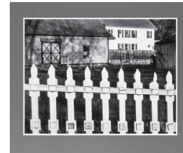
Title: The White Fence, Port Kent, New York (from Paul Strand: Portfolio Three) Date: 1916 (printed 1981) Primary Maker: Paul Strand Medium: gelatin silver print, gold-toned and varnished