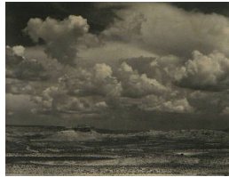
Title: Badlands Near Santa Fe, New Mexico Date: 1930 Primary Maker: Paul Strand Medium: platinum print