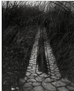
Title: Driveway, Orgeval (from Portfolio Two: The Garden) Date: 1957 (printed 1975) Primary Maker: Paul Strand Medium: gold-toned and varnished gelatin silver print