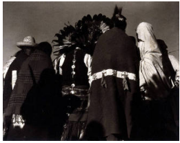
Title: Apache Fiesta Date: 1930 Primary Maker: Paul Strand Medium: platinum print