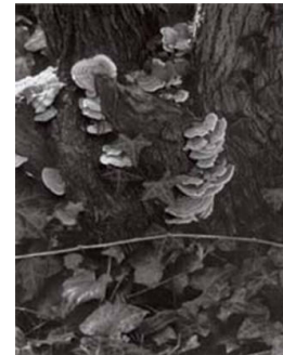
Title: Fungus, Orgeval (from Portfolio Two: The Garden) Date: 1967 (printed 1975) Primary Maker: Paul Strand Medium: gold-toned and varnished gelatin silver print