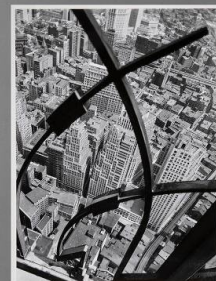
Title: City Arabesque, Wall Street, New York (from the Retrospective Portfolio), 1938 Date: 1938 (printed 1982) Primary Maker: Berenice Abbott Medium: gelatin silver print