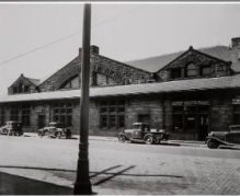
Title: Abbott Village, Maine, #4 Date: n.d. Primary Maker: Berenice Abbott Medium: gelatin silver print