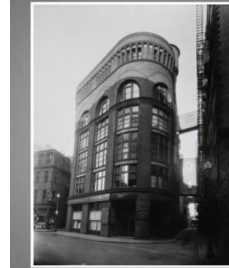
Title: Abbott Village, Maine, #3 Date: n.d. Primary Maker: Berenice Abbott Medium: gelatin silver print