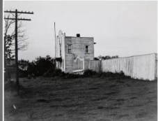
Title: Abbott Village, Maine, #2 Date: n.d. Primary Maker: Berenice Abbott Medium: gelatin silver print