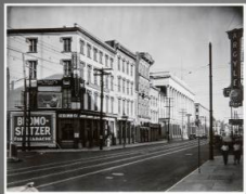
Title: Abbott Village, Maine (Bromo Seltzer sign) Date: circa 1930 Primary Maker: Berenice Abbott Medium: gelatin silver print