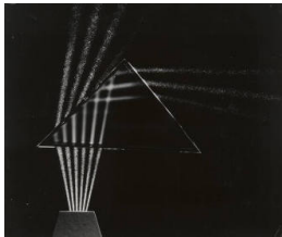
Title: Beams of Light Through Glass (from the Retrospective Portfolio) Date: 1958-1961 (printed 1982) Primary Maker: Berenice Abbott Medium: gelatin silver print