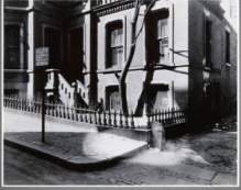
Title: Abbott Village, Maine Date: n.d. Primary Maker: Berenice Abbott Medium: gelatin silver print