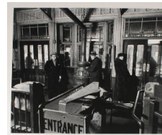
Title: 'El' Station 6th and 96th Avenue Lines Downtown Side, 72nd Street and Columbus (from the Retrospective Portfolio) Date: circa 1936 (printed 1982) Primary Maker: Berenice Abbott Medium: gelatin silver print