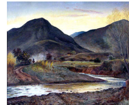
Title: Rio Hondo Date: 1940-1941 Primary Maker: Peter Hurd Medium: egg tempera on gesso on wood panel