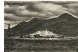
Title: The Little Circus Date: n.d. Primary Maker: Peter Hurd Medium: Ink on paper