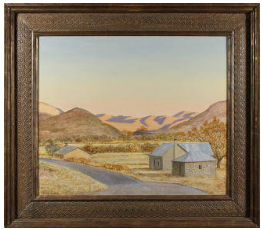
Title: Our Valley in Autumn Date: late 1960s Primary Maker: Peter Hurd Medium: Tempera on board