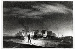
Title: The Santa Fe Trail Date: circa 1946 Primary Maker: Peter Hurd Medium: lithograph