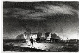
Title: The Santa Fe Trail Date: circa 1946 Primary Maker: Peter Hurd Medium: lithograph