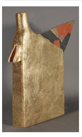
Title: Flame Gas Can Date: 1982 Primary Maker: Rick Dillingham Medium: reassembled, kiln fired clay with slips, glazes and metallic leaf