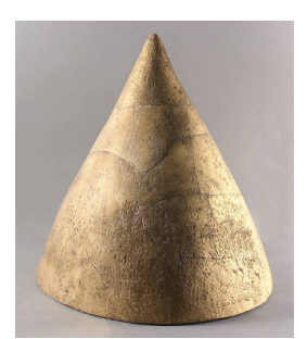
Title: Cone Date: 1979 Primary Maker: Rick Dillingham Medium: kiln fired, reassembled with slip glazes metallic