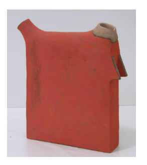
Title: Gas Can Date: 1987 Primary Maker: Rick Dillingham Medium: ceramic