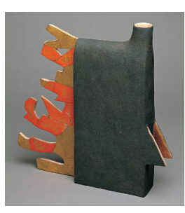
Title: Gas Can Date: 1972 Primary Maker: Rick Dillingham Medium: Post fired reduction (American Raku)