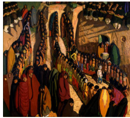
Title: Dance at Taos Date: 1923 Primary Maker: Ernest L. Blumenschein Medium: oil on canvas