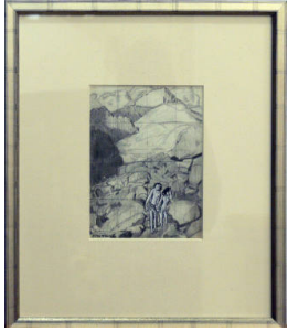
Title: Adam and Eve in a Mountain Landscape Date: n.d. Primary Maker: Ernest L. Blumenschein Medium: gouache, ink and pencil on board