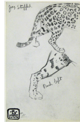
Title: Jag. Stuffed Date: n.d. Primary Maker: Ernest L. Blumenschein Medium: pencil on paper