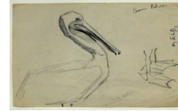
Title: Brown Pelican Date: mid 20th Century Primary Maker: Ernest L. Blumenschein Medium: pencil on paper