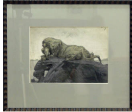
Title: After Bayre (Lion Passant) Date: circa 1895 Primary Maker: Ernest L. Blumenschein Medium: gouache, ink and pencil on paper