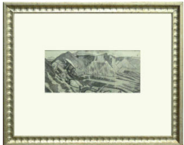
Title: Horse Drawn Wagon in Picuris Date: n.d. Primary Maker: Ernest L. Blumenschein Medium: pencil on paper mounted on cardboard