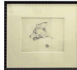
Title: Head of a Bear Date: circa 1900 Primary Maker: Ernest L. Blumenschein Medium: ink and pencil on paper