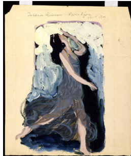
Title: Isadora Duncan - Paris Opera Date: circa 1900 Primary Maker: Ernest L. Blumenschein Medium: gouache on laid paper