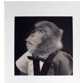
Title: Choromatsu (Plate II) (from the book Suo Sarumawashi) Date: 2008 (printed 2010) Primary Maker: Hiroshi Watanabe Medium: pigment print