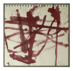
Title: Untitled Drawing 3/23/2011 (verso)

Primary Maker: John Beech Medium: Ink on paper