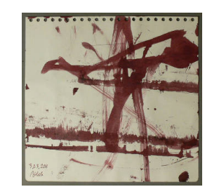
Title: Untitled Drawing 3/23/2011 (recto)

Primary Maker: John Beech Medium: ink on paper