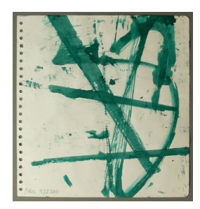
Title: Untitled Drawing 3/22/2011 (verso)

Primary Maker: John Beech Medium: ink on paper