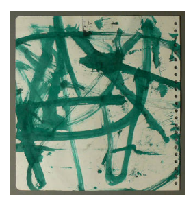
Title: Untitled Drawing 3/22/2011 (recto)