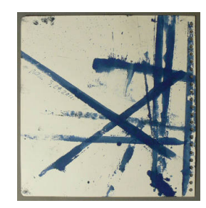
Title: Untitled Drawing 3/24/2011

Primary Maker: John Beech Medium: Ink on paper