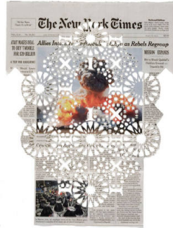
Title: 3.21.11 Date: 2011 Primary Maker: Donna Ruff Medium: hand-cut newspaper