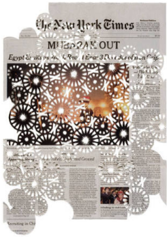
Title: 2.12.11 Date: 2011 Primary Maker: Donna Ruff Medium: hand-cut newspaper