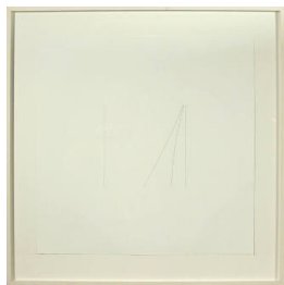
Title: 3/27/03 [S10] Areas II Date: 2003 Primary Maker: James Howell Medium: iris print on paper