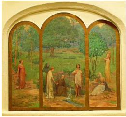
Title: Apotheosis of St. Francis Date: 1917 Primary Maker: Donald Beauregard Medium: oil on canvas