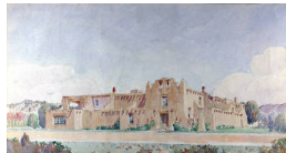
Title: New Art Museum, Santa Fe - East Front Date: before 1916 Primary Maker: Kenneth Chapman Medium: watercolor on paper