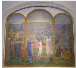
Title: Renunciation of Santa Clara Date: 1917 Primary Maker: Donald Beauregard Medium: Oil on canvas