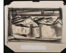
Title: Adobe and Wild Plums (Preliminary Sketch) Date: n.d. Primary Maker: Doel Reed Medium: lithograph pencil on paper