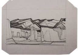
Title: Adobe and Wild Plums (Transfer Sketch) Date: n.d. Primary Maker: Doel Reed Medium: lithograph pencil on paper