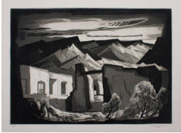
Title: Adobe and Wild Plum Date: 1964 Primary Maker: Doel Reed Medium: aquatint and etching