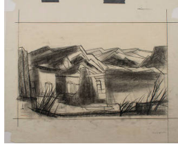
Title: Adobe and Wild Plums (Preliminary Sketch) Date: n.d. Primary Maker: Doel Reed Medium: charcoal on tissue paper