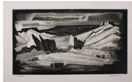
Title: Cañoncito Date: 1967 Primary Maker: Doel Reed Medium: etching and aquatint