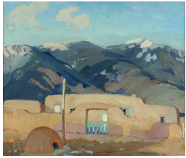
Title: Adobe House and Taos Mountains