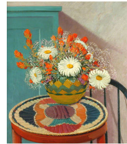
Title: Indian Paint Brush