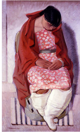
Title: Sleeping Model Date: n.d. Primary Maker: Victor Higgins Medium: oil on canvas