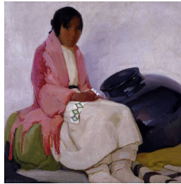
Title: The Beadworker