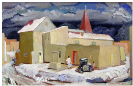
Title: Taos Street in Winter Date: n.d. Primary Maker: Victor Higgins Medium: Oil on canvas