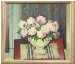
Title: Floral Still Life