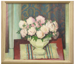
Title: Floral Still Life Date: n.d. Primary Maker: Victor Higgins Medium: oil on canvas