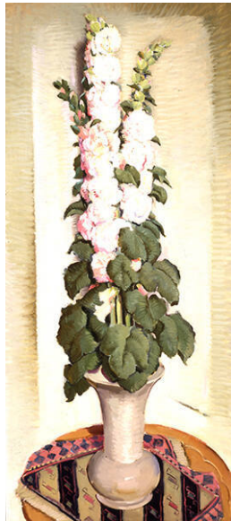
Title: Flower Panel Date: n.d. Primary Maker: Victor Higgins Medium: oil on canvas