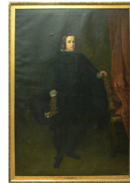
Title: Study of 'Retrato del príncipe Baltasar Carlos' by Juan Bautista Martínez del Mazo Date: circa 1895 Primary Maker: Joseph Henry Sharp Medium: oil on canvas