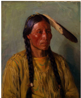
Title: Portrait of Taos Indian Date: October 1911 Primary Maker: Joseph Henry Sharp Medium: oil on canvas