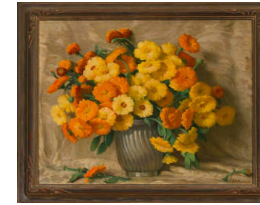
Title: Marigold-Calendula Date: circa 1935 Primary Maker: Joseph Henry Sharp Medium: oil on canvas