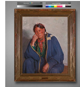
Title: Taos Indian Portrait Date: 1914 Primary Maker: Joseph Henry Sharp Medium: oil on canvas