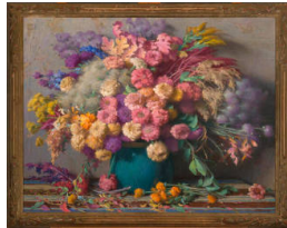
Title: Dry Flowers Date: circa 1935 Primary Maker: Joseph Henry Sharp Medium: oil on canvas