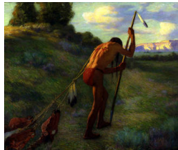
Title: The Stoic Date: 1914 Primary Maker: Joseph Henry Sharp Medium: oil on canvas