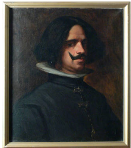
Title: Study of 'Self-Portrait by Diego Velázquez' Date: circa 1890s Primary Maker: Joseph Henry Sharp Medium: oil on canvas