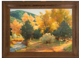
Title: Taos Cañon: Cottonwood, Box Elder, Cedar, and Sage Date: circa 1935 Primary Maker: Joseph Henry Sharp Medium: oil on canvas