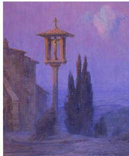
Title: Fiesole, Italy Date: 1926 Primary Maker: Gerald Cassidy Medium: oil on canvas