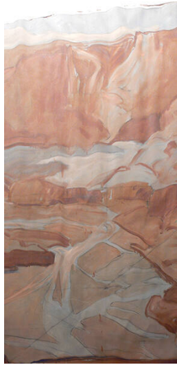
Title: Canyon de Chelly Mural (unfinished) Date: 1934 Primary Maker: Gerald Cassidy Medium: oil on canvas