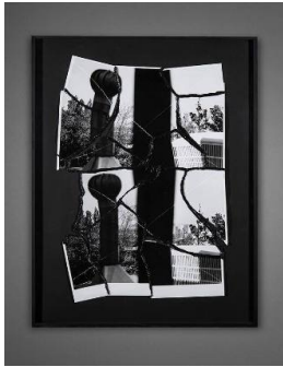
Title: f2 Downtown Albuquerque (from the series Modest Structures - Downtown Albuquerque) Date: 1981 Primary Maker: Thomas Barrow Medium: Reconstructed gelatin silver photographs with caulking, staples and spray paint