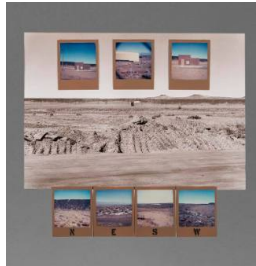
Title: College Well and Reservoir Date: 1983 Primary Maker: Thomas Barrow Medium: gelatin silver prints, sepia toned, with diffusion transfer prints