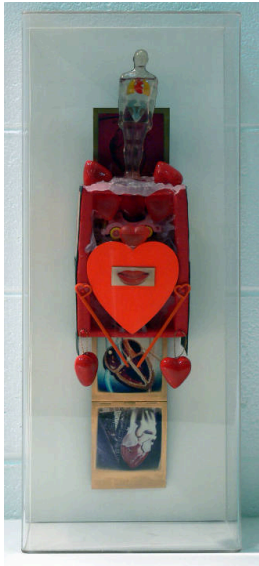
Title: Altered Heart Date: 1990 Primary Maker: Thomas Barrow Medium: mixed media